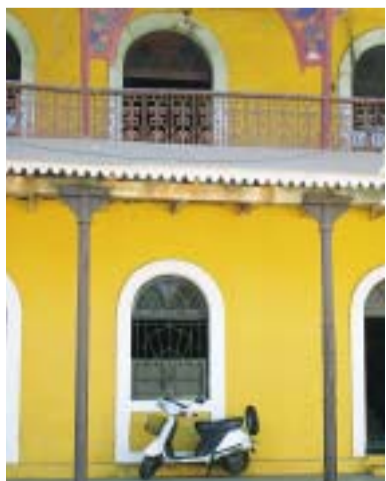
GOA COLOURS: The vibrant shades of Panaji make it a boon for shutterbugs.

As I began walking, a Japanese Gen X'er wearing a Guns N Roses t-shirt and sporting shoulder-length hair pulled up on a motorbike and offered me a lift to town.